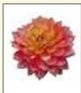
D. 'Charlie Dimmock'

Fully double blooms, showing no disc. Ray florets are narrowly lanceolate and either involute or revolute.