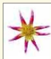
D. 'Juul's Allstar'

Fully double, spherical blooms of miniature size, not exceeding 50mm in diameter, with florets involute for the whole of their length.