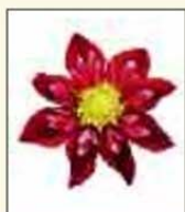
D. 'Don Hill'

Single outer ring of florets surrounding the disc. Ray florets are uniformly either involute or revolute.