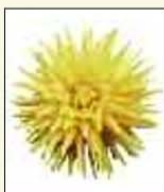
D. 'Lakeland Sunset'

A single outer ring of generally flat ray florets, which may overlap, with a ring of small florets (the collar), the centre forming a disc.