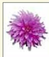
D. 'Mayan Pearl'

Fully double blooms, the ray florets are usually pointed, the majority narrow and revolute for 50% or more of their length and either straight or incurving.