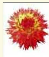
D. 'Anna Cozens'

Fully double blooms, ball shaped or slightly flattened. The ray florets are blunt or rounded at the tips, spirally arranged, with margins involute for at least 75% of the length of the florets.