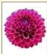
D. 'Dikara Midnight'

Fully double blooms, ray florets usually pointed, and revolute for more than 25% of their length and less than 50% of their length (longitudinal axis), broad at base and either straight or incurving.