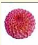
D. 'Will's Ringwood Rosie'

One or more outer rings of generally flattened ray florets surrounding a dense group of tubular florets, which are longer than the disc florets in single dahlias, and showing no disc.