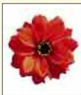
D. 'Bishop of Llandaff'

Fully double blooms showing no disc. The ray florets are generally broad and flat, or slightly twisted and usually bluntly pointed, and may be involute for no more than 75% of their length.