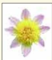
D. 'Ryecroft Marge'

Ray florets evenly split or notched into two or more divisions, uniformly throughout the bloom creating a fringed effect. Petals may be flat, involute, revolute, straight, incurving or twisted.