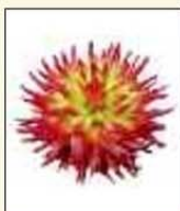
D. 'Julie's Delight'

Fully double blooms characterised by broad, generally sparse ray florets, either straight or slightly involute along their length giving a shallow appearance. Depth should be less than half the diameter of the bloom.